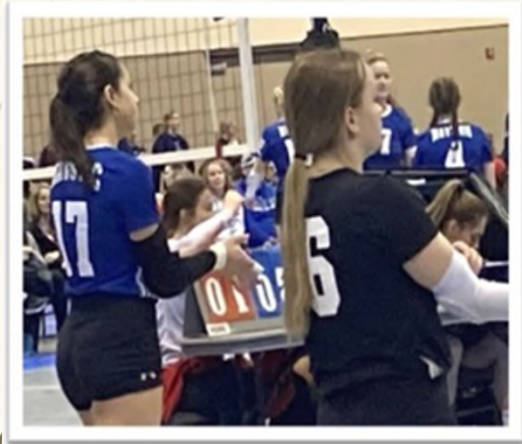
Libero does not contrast