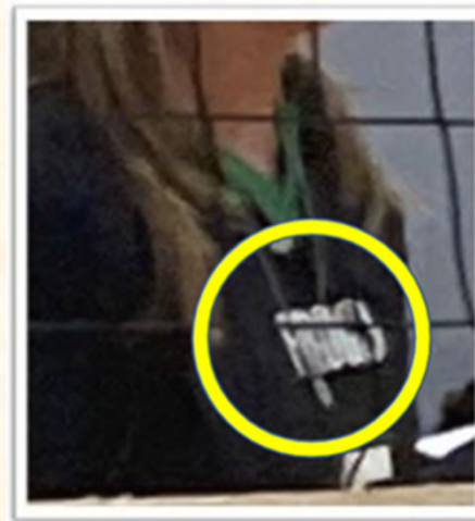
Necklace is too long