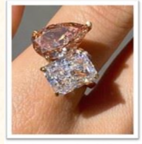
Stone is too large / has sharp edges